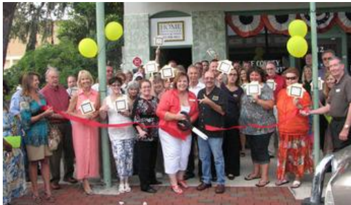
Home Realty Ribbon Cutting