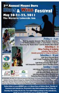
Mt Dora Blues Fest

Have we seen you out in the community lately? Here are just a few of the places we have been!